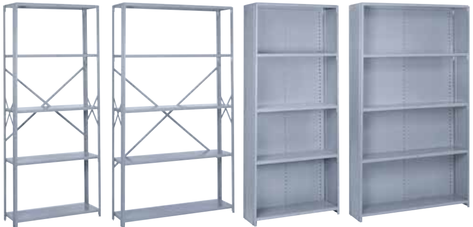
36" Wide Open