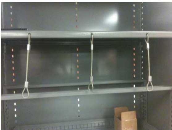
Final shelf assembly with 3 cable assemblies