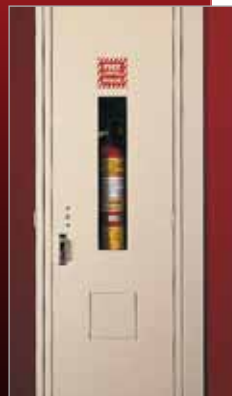
Fire Extinguisher Lockers